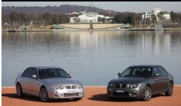
ZT Mk I and ZT Mk II In the National Capital

Acknowledgments – the editorial team says thank you to all who contributed articles and photographs for the magazine.